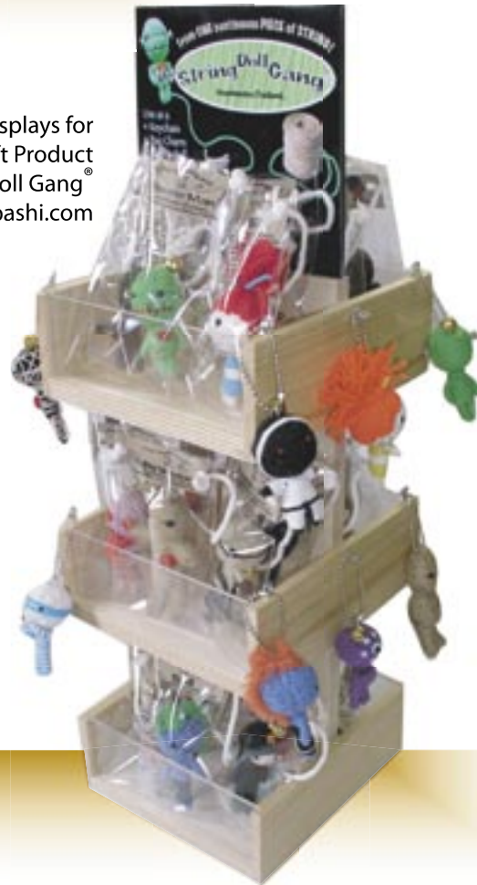
On Counter Displays for Novelty Gift Product The String Doll Gang® www.kamibashi.com