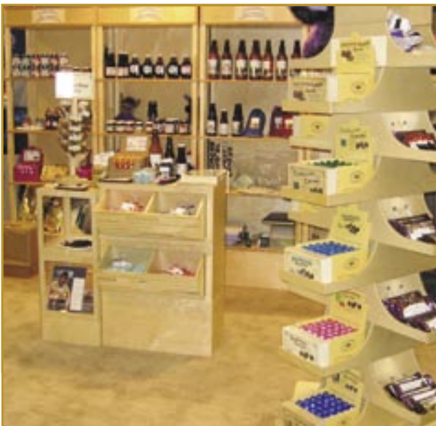
Trade Show Booth & Fixtures for Gourmet Gift Huckleberry Mountain www.huckleberrymountain.com