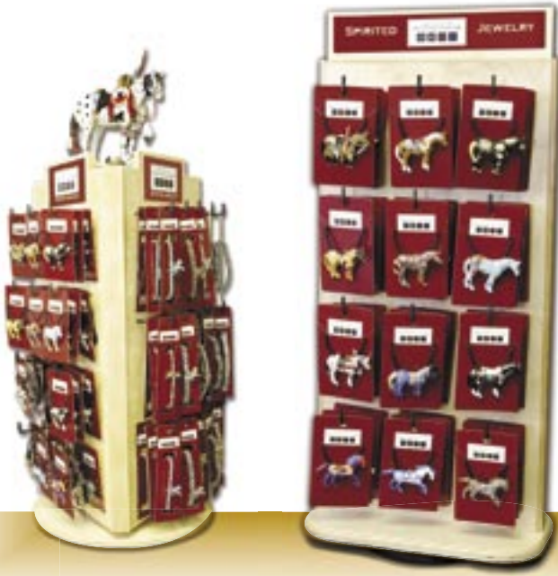
Spinners for Licensed Jewelry for The Trail of Painted Ponies™ www.pacificsilver.com

Let our design team work with you to build a display specially suited for your product line. Know in advance that your merchandise is consistently presented with a wood display in the best location possible. Join our team of manufacturers who trust us to custom fit their products in wood.